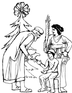
Child receiving the Saturnalia gift, called sigillaria

hosts. The Christmas tree is also an ancient pagan symbol. And so is the Christmas exchange of gifts, which the pagan Romans called sigillaria , during which the children were given gifts of small figurines of clay or wax.