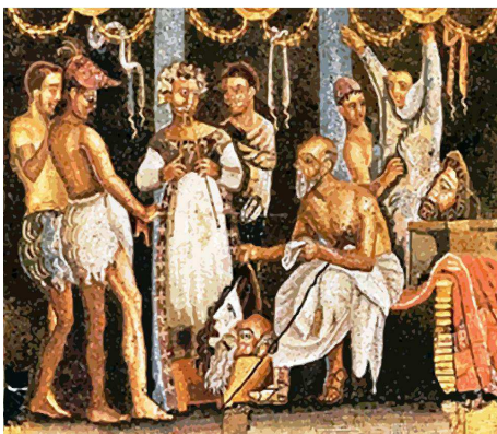
Celebrating Saturnalia. This mosaic from Pompeii presents a considerable number of similarities with the celebration of Christmas.

openly confessed the pagan origins of Christmas. And so I learned that the ancient pagan nations had a great festival dedicated to the birth of the sun god, which had different names, according to the different languages. The Egyptians called him Osiris, the Babylonians Tammuz, the Persians Mythra