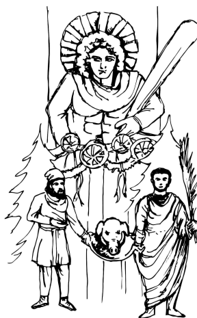
Pagan Sun worshippers

depart from the Scriptures and started giving their own laws and rules. After the time of Constantine the Great, ruler of the Roman Empire from AD 306 to 337, when Christianity became the official religion of the Empire, making a lethal compromise with the State, multitudes of pagans were “Christened,” while still devoted to their own gods. Not being able to separate them from their idols, the Church decided to keep the pagan date and customs, but give them Christian names. John Chrysostom (AD 347-407), among many others, associated the pagan holiday with the name of Christ. Says he: “But they call it the ‘Birthday of the Unconquered. Who indeed is so unconquered as Our Lord...? Or, if they say that it is the birthday of the Sun, He is the Sun of Justice.” Such was the way in which the Christianized pagans