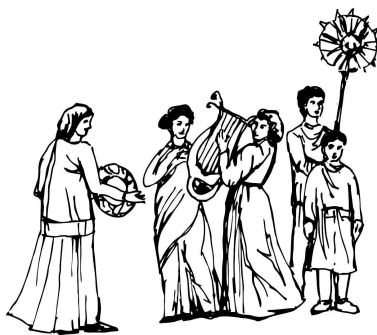
Young pagans caroling during Saturnalia

and the Romans Saturn, and gave him the title Sol Invictis , the Unconquered Sun. It was the same god everywhere, only the names differed. All these pagan nations celebrated the birth of the sun god in the winter time, just after the solstice (December 21 st ), because that's when the day starts increasing again. The Romans celebrated the Saturnalia during this time, the holiday dedicated to Saturn. During this period, there was an excess of eating, drinking and all sorts of orgies, a merry time for pagans. And December 25 th was the climax of pagan "spirituality." The Christmas carols are also directly connected to this pagan holiday. The Romans called them calendae . Groups of people went from house to house, wishing luck, happiness and fertility to their